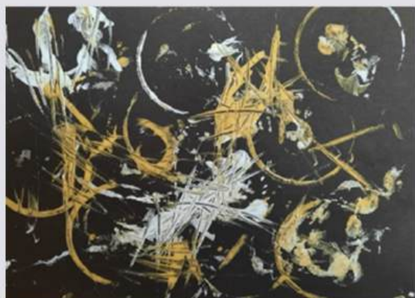
'LINES OF REGULATION' BY ISLA