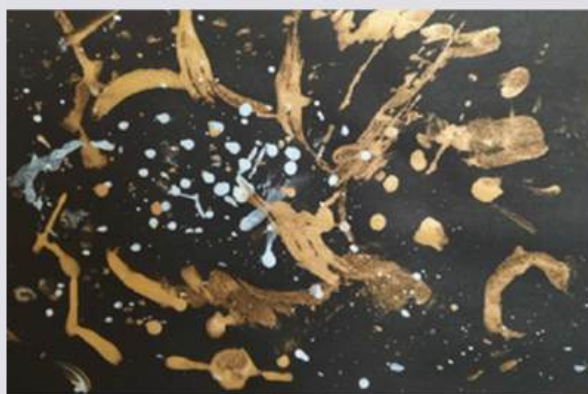
'LINE EXPLOSION' BY LUCAS

This month, we're admiring the work of our artists in year 1. In year 1 - children are working on the key artistic principle of line. Children's work here shows their exploration of different types of line (straight, curved, zigzag etc) by printing and painting on black paper - well done to these young artists! Like all artists - children have named their creations and their titles this month are particularly enjoyable!