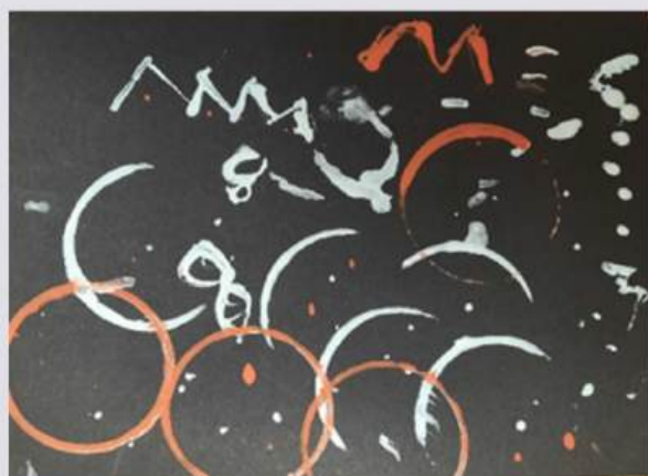
'LINES EVERYWHERE' BY LIVVIE