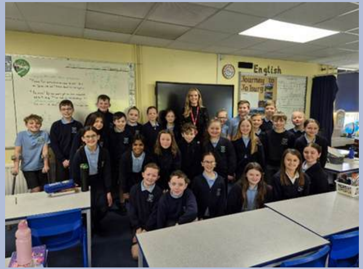
YEAR 5 WILLOW WITH KATE DEARDEN (MP FOR HALIFAX) WHO VISITED SCHOOL TO DISCUSS HER WORK AND CAREER DURING DREAM BIG WEEK.