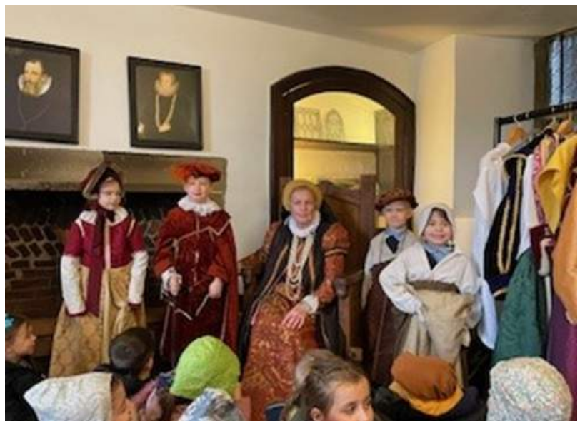
Experiencing Tudor Life at Manor Lodge (year 2)