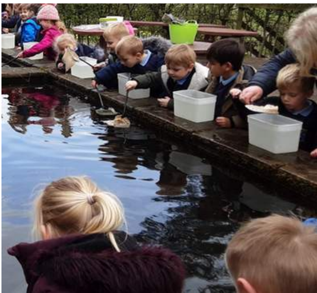
Pond Dipping at Nell Bank (Reception)