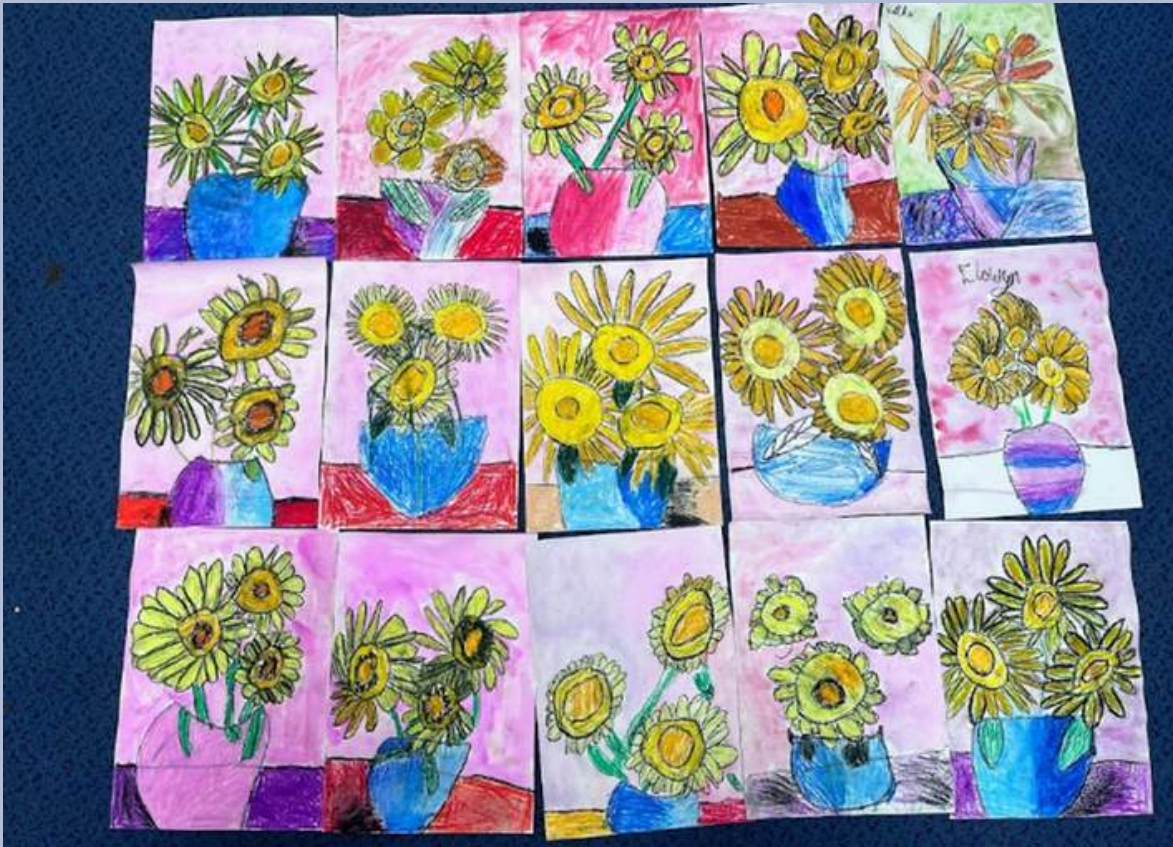
Sunflowers by Year 3 Oak