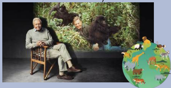
David Attenborough - 100 years on planet Earth

This year, our school scarecrows honour David Attenborough (very much a school hero!) who turned 100 this year!