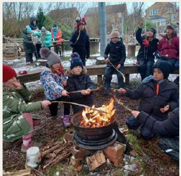
Year 4 concentrating hard on baking their dough sticks around the fire in mid-Winter